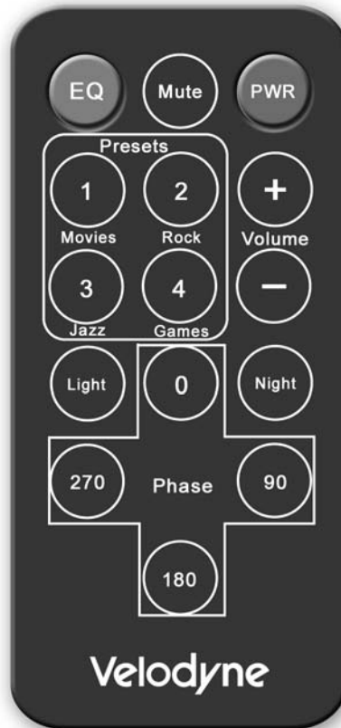
Figure 3. Remote Control

NOTE: The Optimum remote can be attached magnetically to the back of the subwoofer in the upper left hand corner.