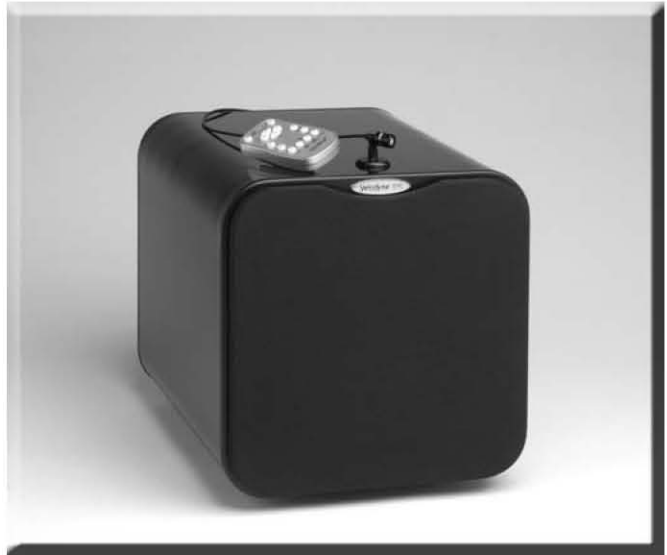
DSP-Controlled Home Theater Subwoofer