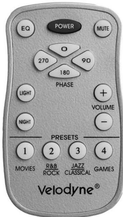
Figure 2. Remote Control

Figure 2 shows the remote control, enabling you to easily choose whatever listening mode you desire.